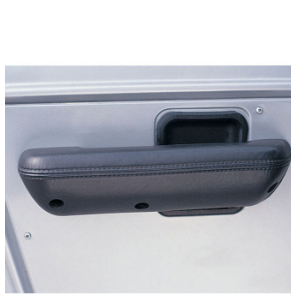
#4715 Arm Rests, Pair