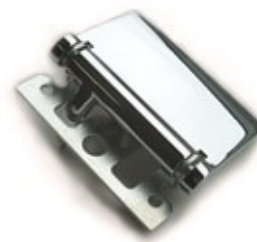
#4254 Interior Door Handle