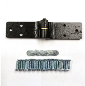
#4235 Duff Removable Hinges