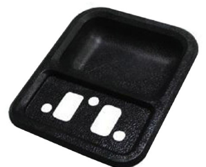
#4718 Door Cups '68-'77 Bronco