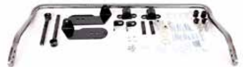
#5312 Hellwig Front Sway Bar