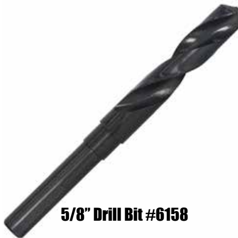
5/8" Drill Bit #6158