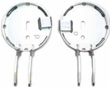
Dual Sport Coil Retainers #5121