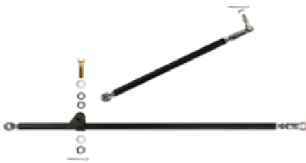
Dual Sport Heim Steering System #5641

Important: If you ever plan on adjusting the bar in the future do not use more than 2 or 3 drops of loctite at the jam nuts.