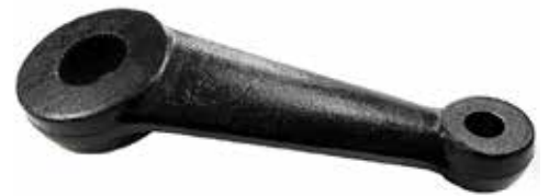
#5472 OE Replacement Pitman Arm