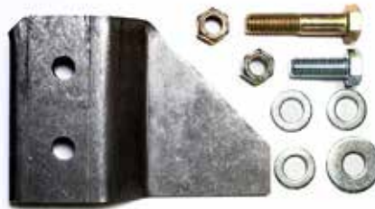
Trac Bar Raise Bracket #5406